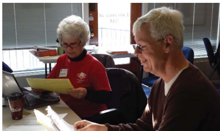
A volunteer tax preparer reviews paperwork and documentation with a taxpayer at the Mon Valley Initiative, Homestead tax clinic.

If you have not yet completed your taxes, there is still help available. You are able to call the United Way helpline, 2-1-1, for assistance.