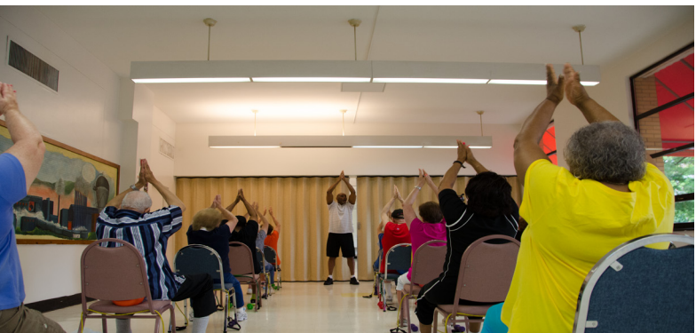
Silver Sneakers class at the Turtle Creek Senior Center