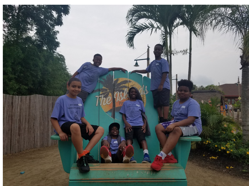
2017 KOOL Program participants during a field trip

KOOL is located at the Human Services Center Corporation, 519 Penn Avenue, Turtle Creek, PA 15145 from July 2-August 17, Monday-Friday, 8:30AM-4:30PM for students going into grades 1-5. Other than a modest application fee the program activities are FREE! For more information or to obtain an application, please call 412-829-7112, visit www.hsc-mvpc.org to download an application, or email loreilly@hsc-mvpc.org .